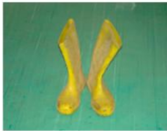
Boots or closed-toe Shoes