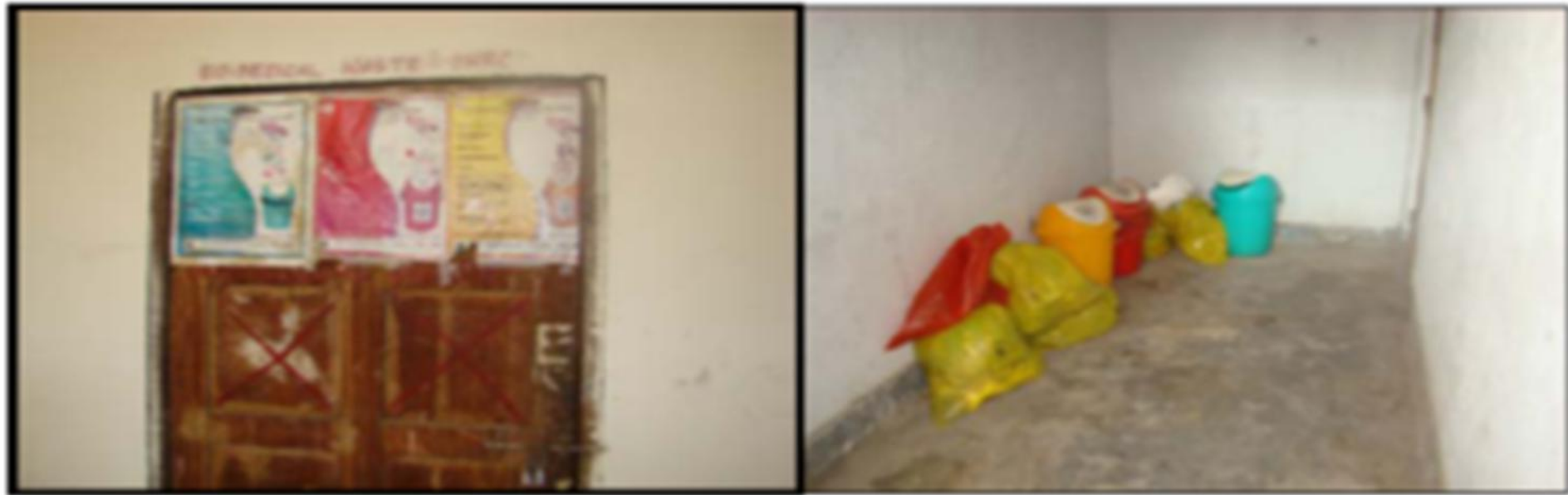
Temporary Central Storage Room