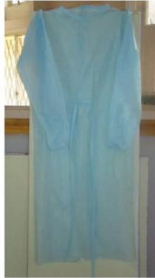
Over garment / Apron